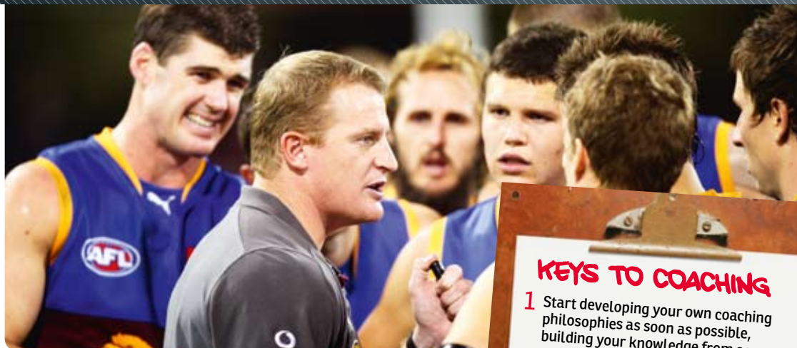
IMPRESSIVE START: Michael Voss has the Lions in fifth place with a 10-6 win-loss record in just his first year as senior coach.

Utilise any past relationship with your players as a positive but be aware of its challenges. I enjoy the rapport I have with the players, which would normally be earned over a long period of time. I can confide in them, seek their opinions and I know they will be honest.